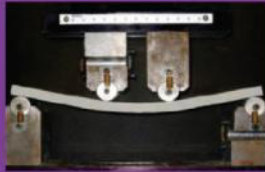
High Bending Strength